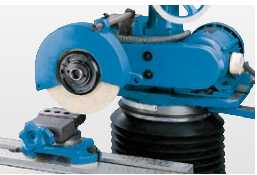
Surface grinder with angular adjustable vise