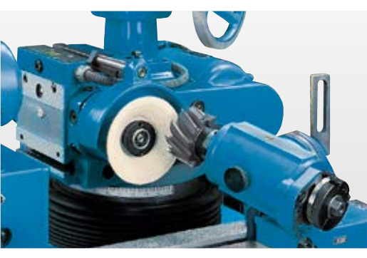
Rigid angle-adjustable workpiece mounts