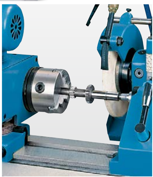
Outside cylindrical grinding for lengths up to 400 mm

Special grinding headstock design allows simultaneous setup of 2 different grinding wheels. The grinding headstock can be moved in transverse direction and also vertically; and it can be rotated around the vertical axis.