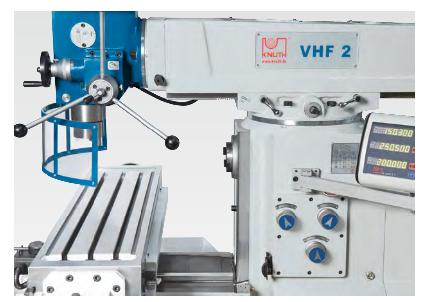
Vertical and horizontal spindles, each with their own drive