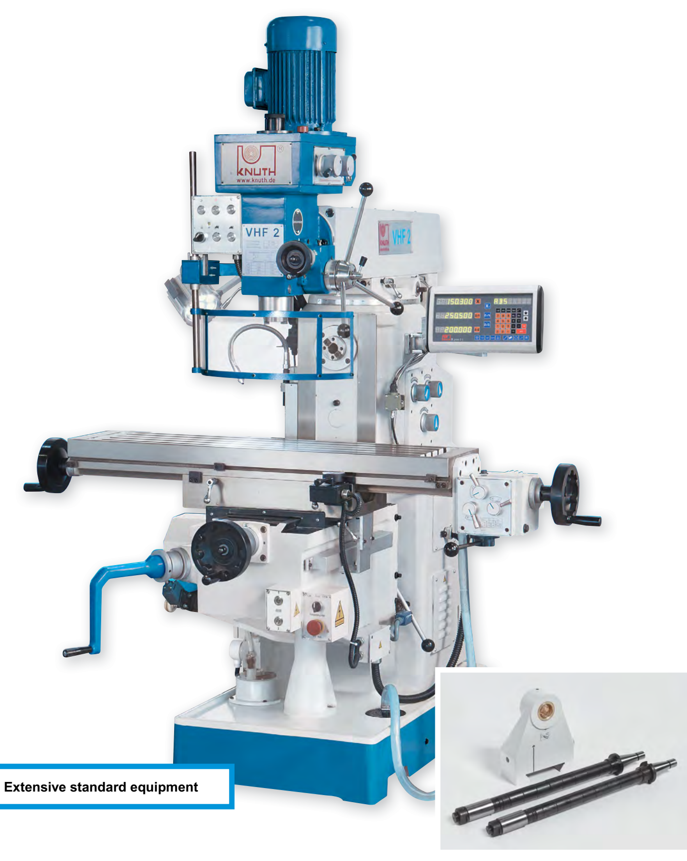
Outer arbor and long milling arbor included in standard equipment

Ideal for single parts and small batch productions, or for training and repair operations