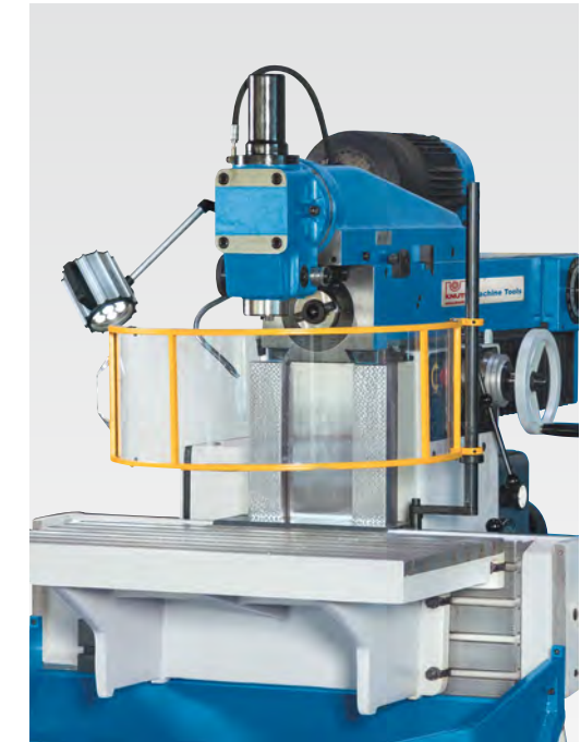
Stable knee with large setup area